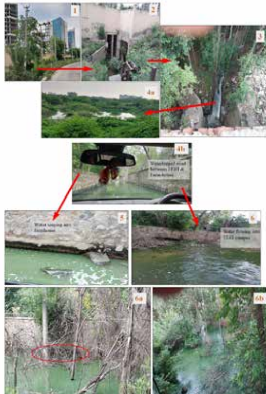
Figure 2: Photographs of overflow and water-logged area