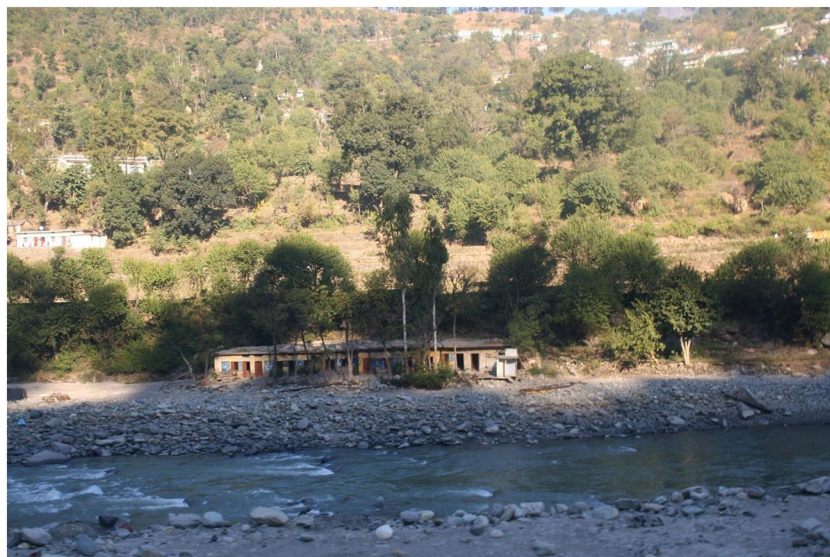
Figure 3. Following the floods of 2013 the school house at Agastmuni was restored in place, on the banks of the Mandakani River. The river now flows only a few metres below the school. Prior to the flood, the school was situated several metres above the river. Thus, the risk of flooding at the school is now much higher than before the flood