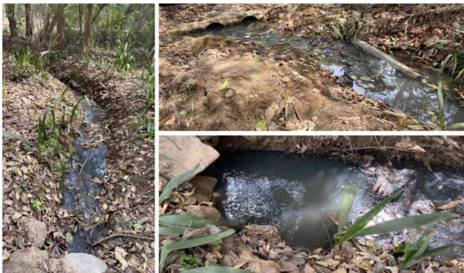
Figure 2 | Photos of the drain flowing through the TERI campus containing untreated sewage from nearby villages.

As shown in Figure 2, the wastewater is slightly discoloured and there is intermittent flow at the point of collection of wastewater. About 5,000 L of sewage flows every day from the village and is only naturally