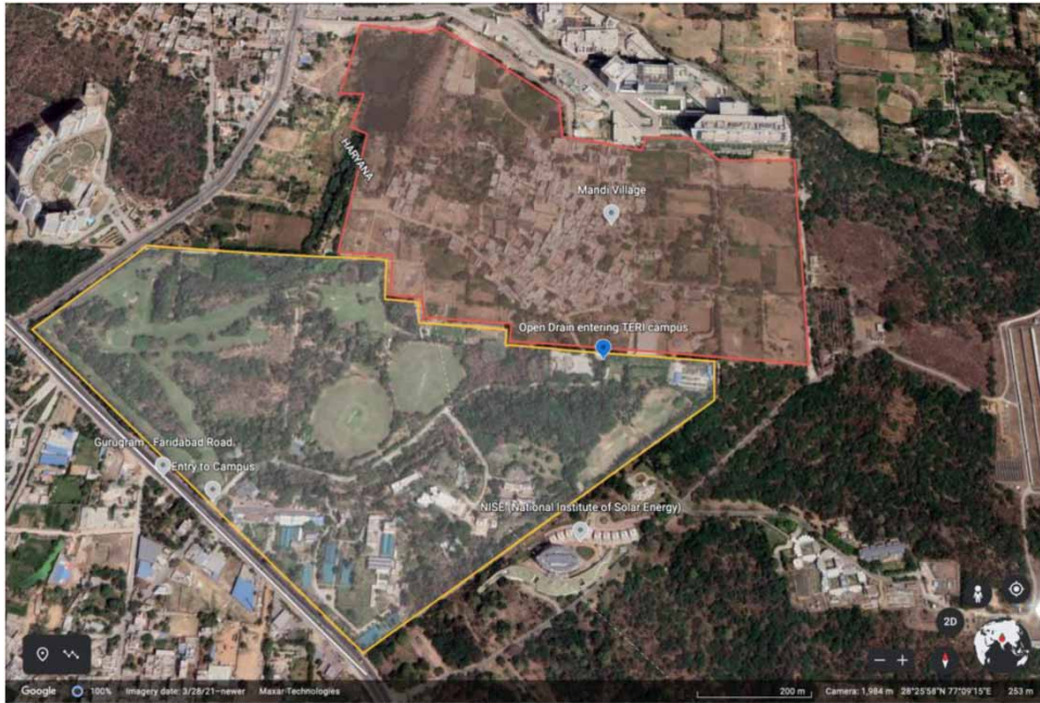
Figure 1 | Satellite imagery showing the location of Mandi village nearby the TERI campus and the open drain entering the TERI campus.

campus comprising of raw sewage, domestic, agricultural and veterinary wastewater. It may be considered as naturally aerated and follows the natural contour and drainage of the area with a horizontal span of 4–6 m within the campus (as shown in Figure 2). From this open drain, a grab sample was collected around Noon on a weekday, the sample was collected from the middle of the flowing stream at about 1.5 m depth with a simple 20 L Polypropylene jar. Water from the polypropylene jar was decanted into two 10 L glass bottles and sealed with a metallic cap ensuring that there was no space for air. Pilot testing on the TADOX ® plant on the same day and all samples were sent for testing and characterization to an accredited laboratory within 6 h in an ice box maintained at 4 °C.